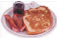
LA BREAD 1.69