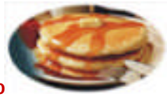
ADD BLUEBERRIES .65